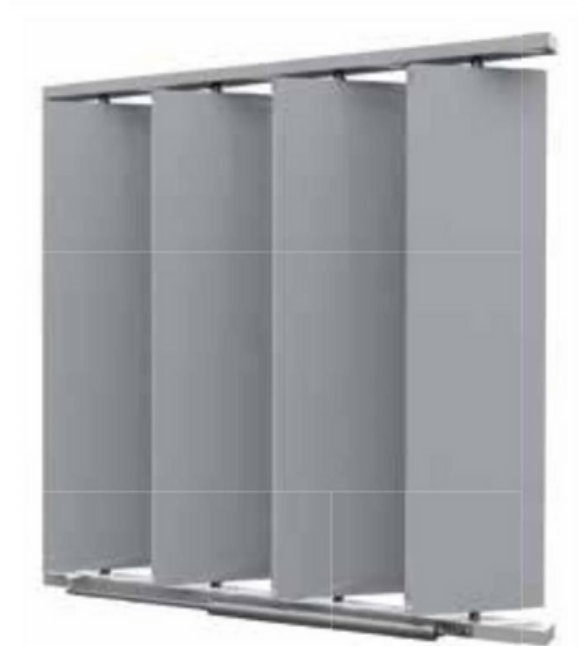
Vertical louvre assembly installation

The R-400 mobile slat system provides adjustable sunlight protection for roofs and facades, reflecting and/or absorbing sunlight before it reaches the building's surface so that this heat is absorbed or reflected and dissipated to the air, with the consequent energy saving this provides in hot weather. It can be installed horizontally or vertically and oriented from 0° (closed position) to 150° (maximum recommended open position), depending on its drive, to make maximum use of the sun's light and heat in cold weather. Option to install photovoltaic panels on the outside of the slat to generate power and achieve energy self-sufficiency.