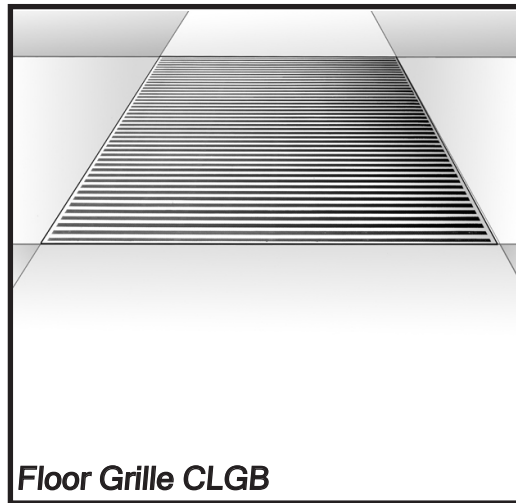
Floor Grille CLBG

Units suitable for finishing flush with carpet, linoleum or wooden floors can be manufactured. Also these grilles are available in stainless steel for prestige environments. Contact our headquarters to discuss your requirements.